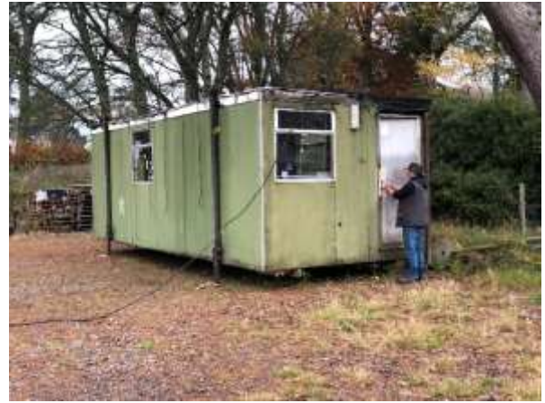
On the ground and in place