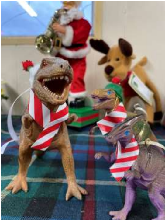
Who'd have thought Dino Decs 2 nd year