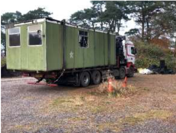
Our Grotto being delivered