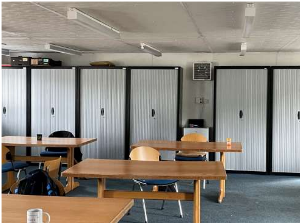
Conference Room with new tambour units

Not only did we have a clear out but also a sort out of the books, vases, some extra Christmas things that don't quite fit in the Christmas cupboard and lots of other treats that we came across!!