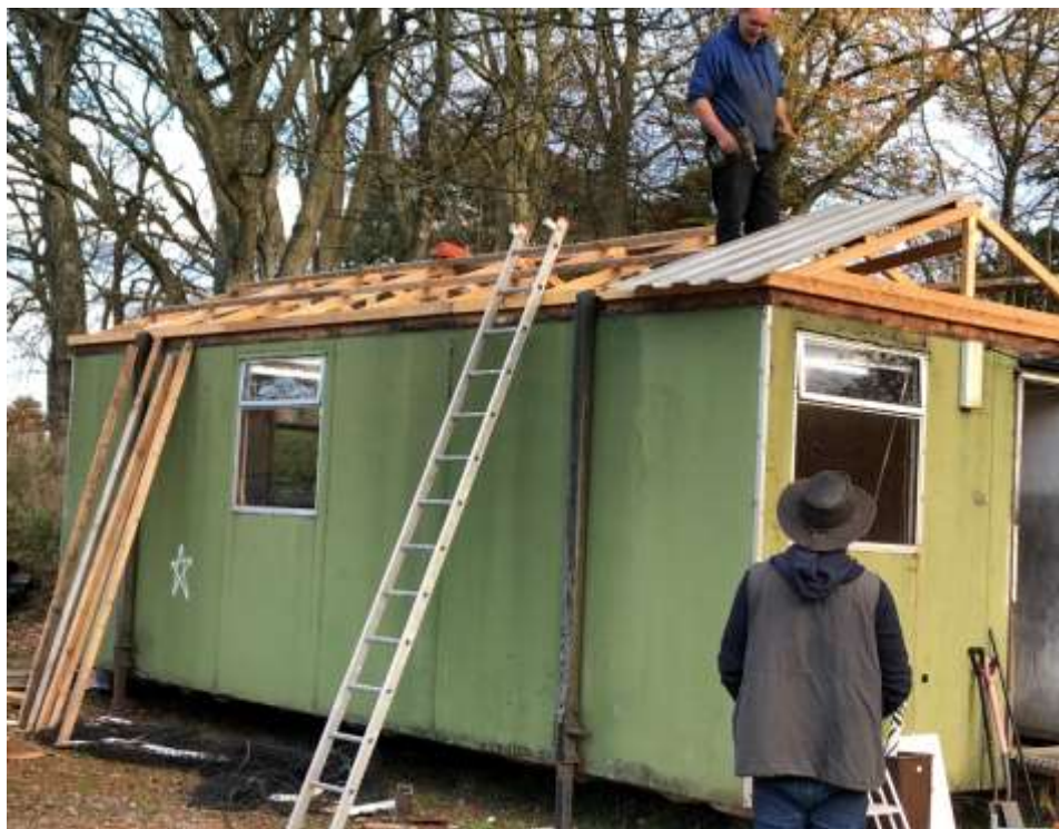
New pitched roof being fitted