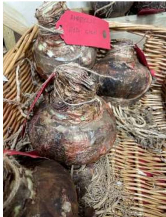
Beautiful Amaryllis Bulbs